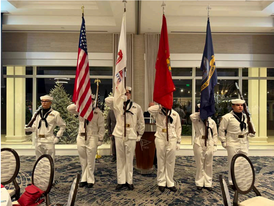
Sea Cadets Color Guard

The captain spoke about his upbringing in Fairbanks, Alaska, and described the motivation behind his decision to seek an appointment to the Academy. He provided insights into his diverse career assignments, which contributed to an engaging and occasionally lighthearted presentation.