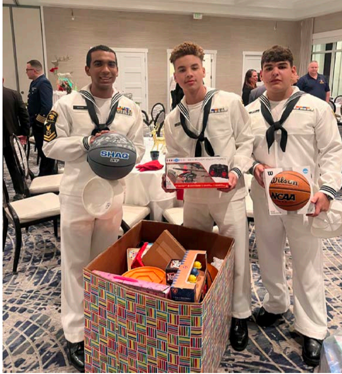
Sea Cadets with Toys For Tots