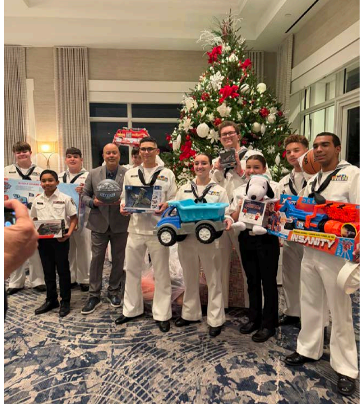
Sea Cadets collect Toys For Tots