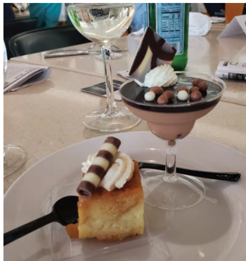
Desserts from the Buffet