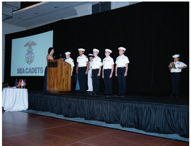
Missing Man Ceremony