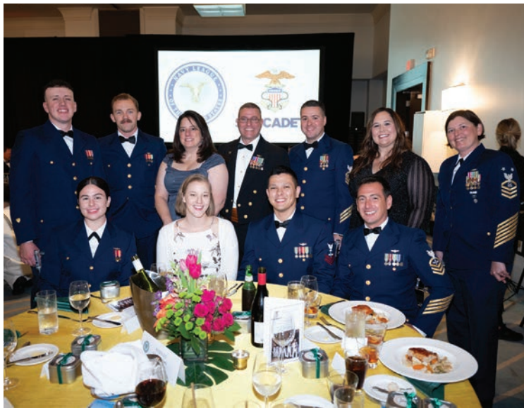
Coast Guard Guests