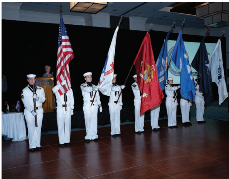
Sea Cadet Color Guard