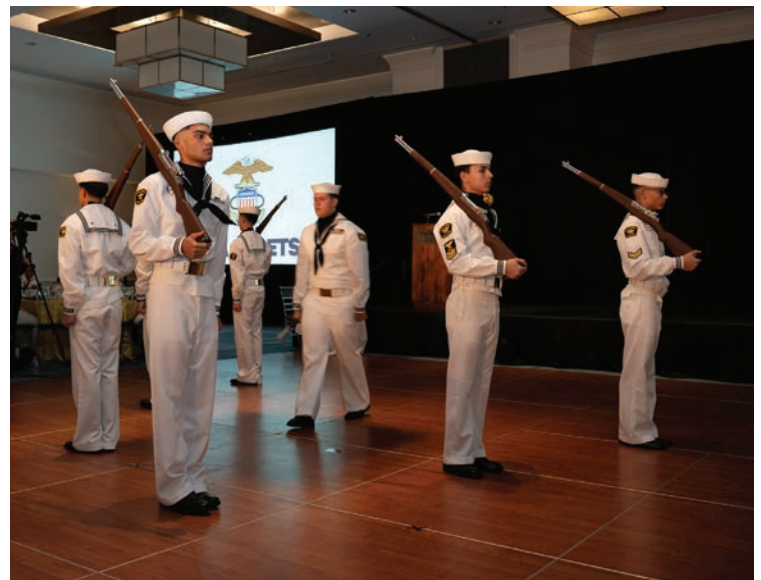
Rifle Team Performance