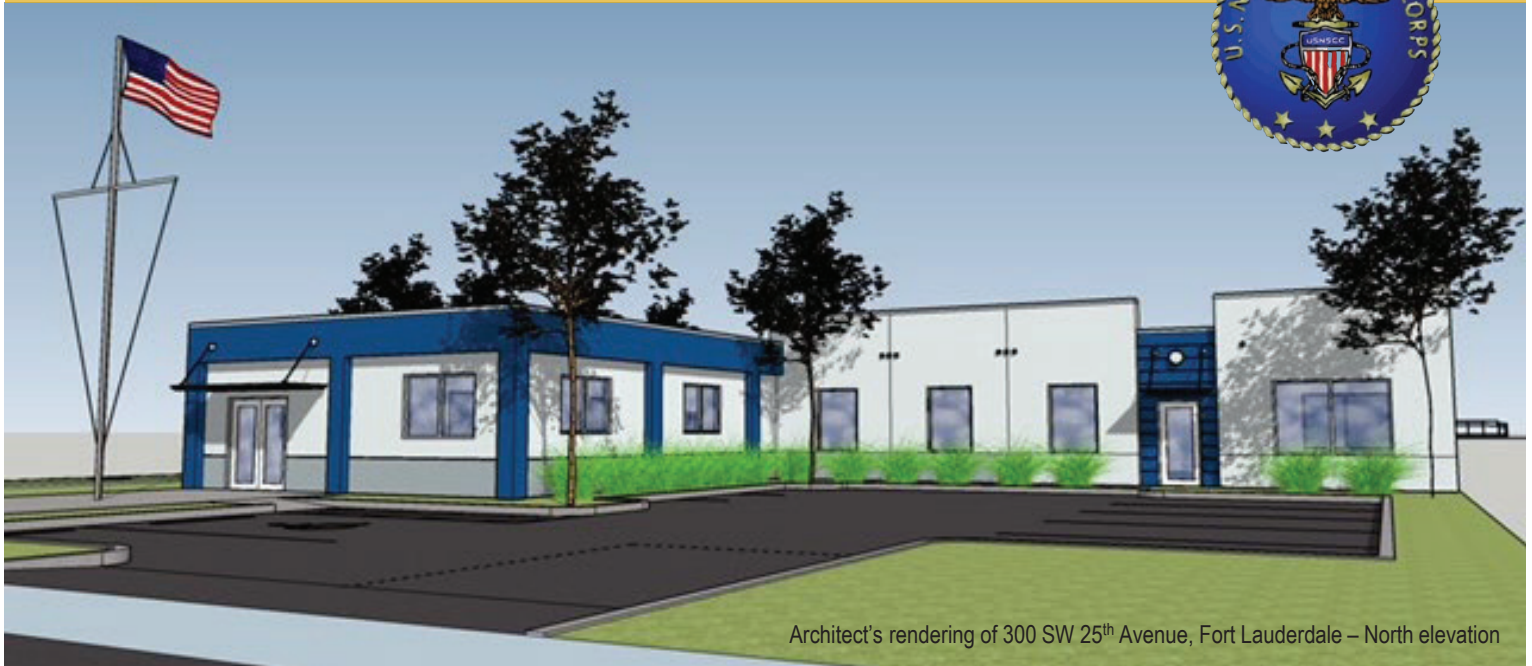
Architect's rendering of 300 SW 25 th Avenue, Fort Lauderdale – North elevation

The Navy League of the United States, Fort Lauderdale Council invites you to become a permanent part of the new Mary N. Porter Sea Cadet Training Center by purchasing a commemorative brick; an easy way to leave a lasting family legacy.