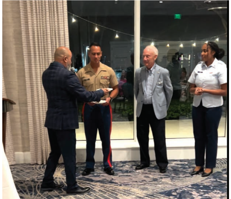
Marine Corps 249 Years Cake Ceremony