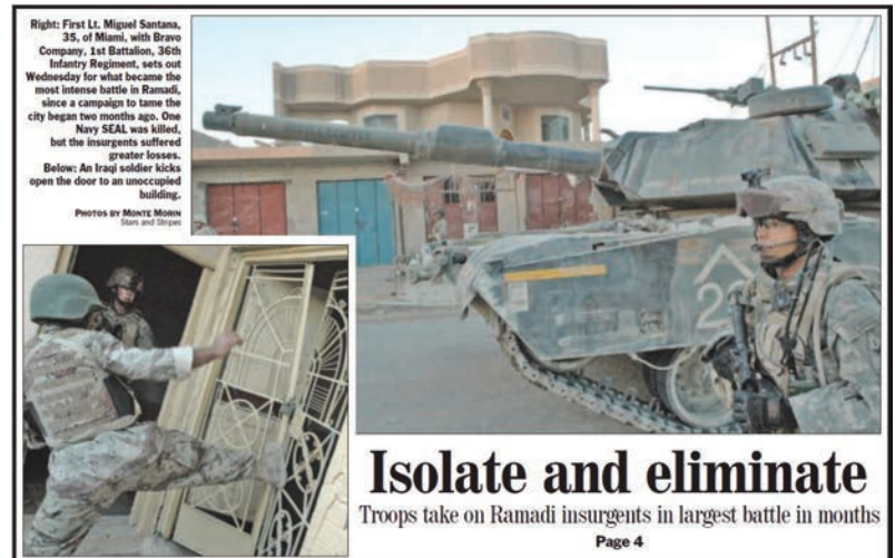
Stars and Stripes - August 2006