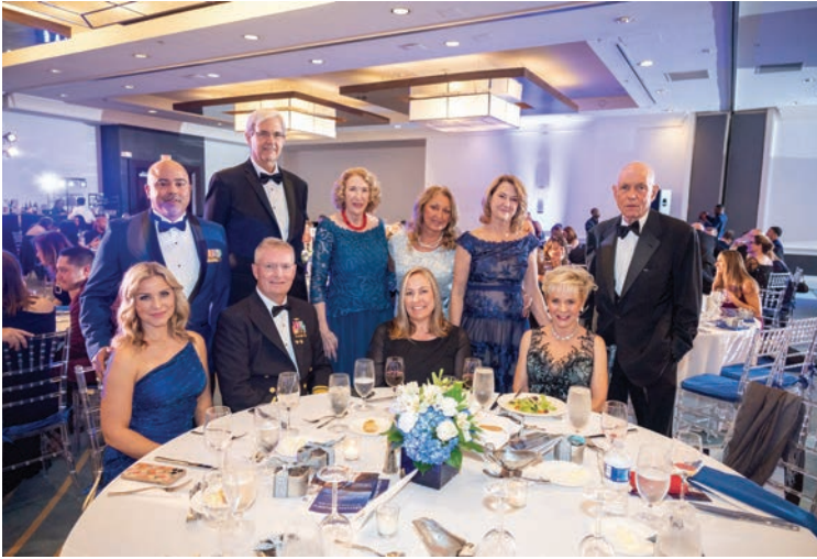
VIP Table with Guest of Honor